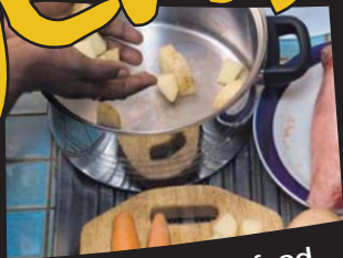
before touching food